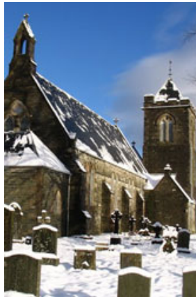
Holy Trinity Parish, Dunoon, Scotland